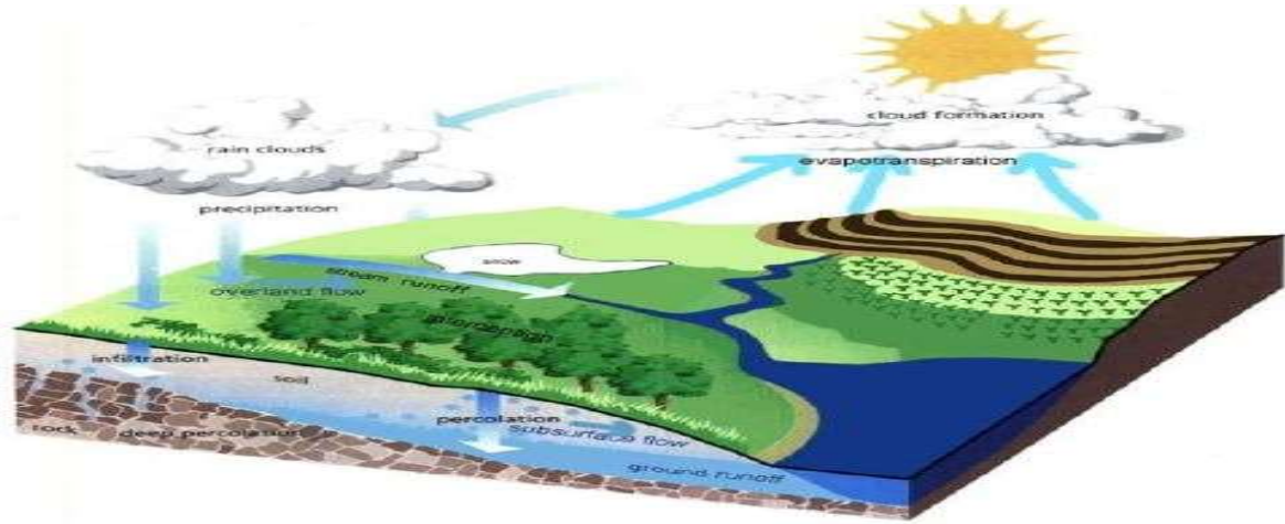
Figure 2. Terrestrial hydrological cycle.

During cold periods a portion of infiltrated water may freeze in the soil. A part of water intercepted by vegetation, accumulated in the land surface depressions, and stored in the soil, may return back to the atmosphere as a result of evaporation. Plants take up a significant portion of the soil moisture from the root zone and evaporate most of this water through their leaves.